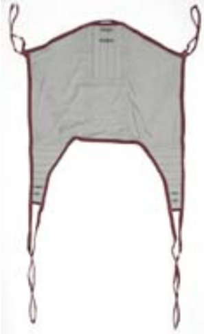
Reusable Highback Sling