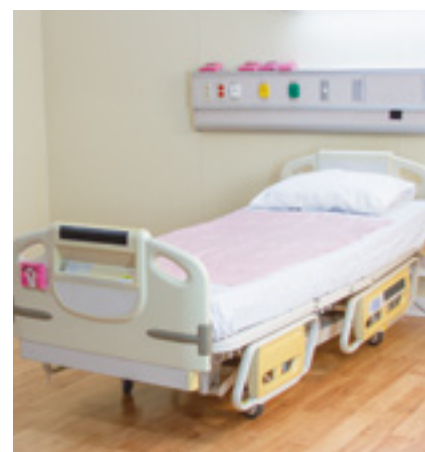
Unfolded On Bed