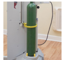
O 2 Tank/IV Pole Holder