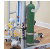
IV Pole/ O 2 Tank Holder*