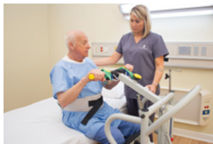
Edge of Bed