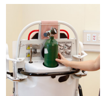
IV / O 2 Storage