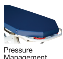
Pressure Management Mattress Upgrade*